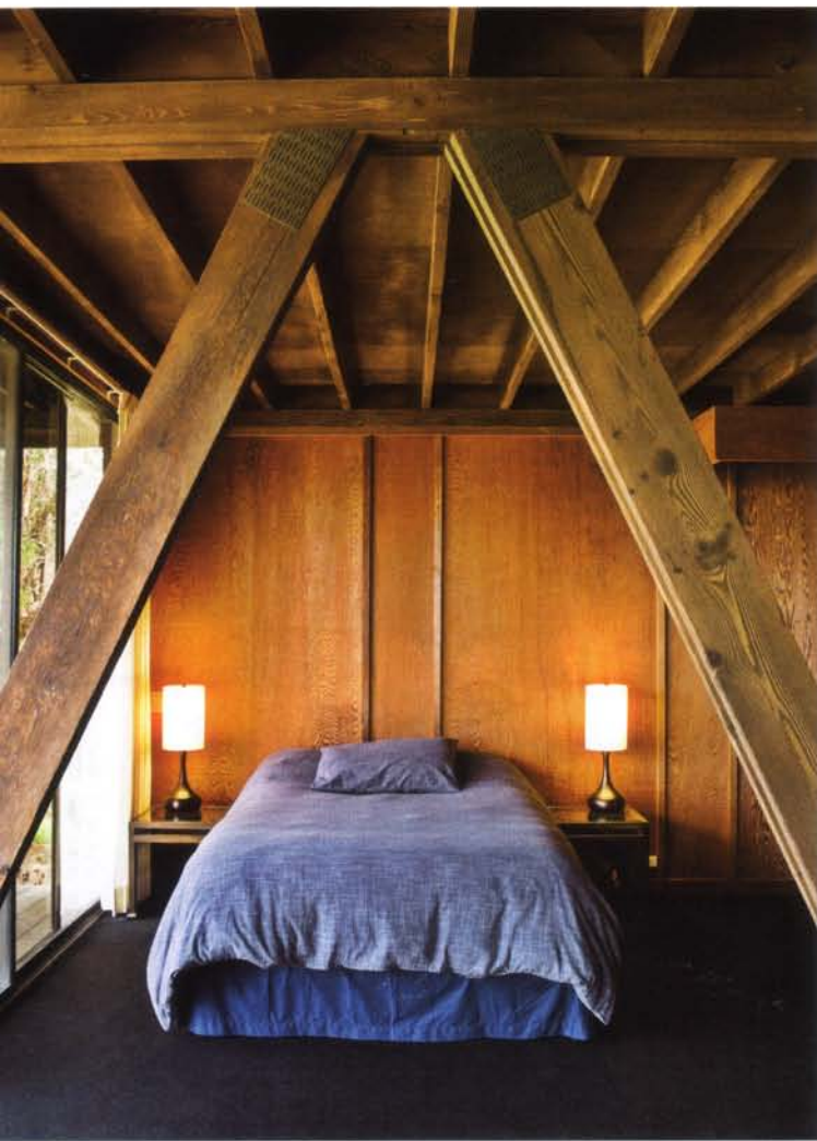
Canted Douglas fir beams, like the A-framed pair in the bedroom (left) define the interior and divide the living space. Greg and Meredith stand on the porch next to one of the home's vacuum-formed